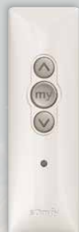
Wall mounted remote