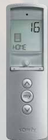
16 Channel remote

Revolutionary scroll wheel – specific for precise adjustment of venetian blind slats. Perfect for managing the level of heat and light entering a room.