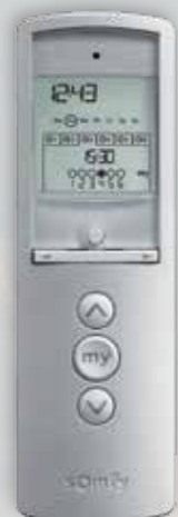
6 Channel remote with timer